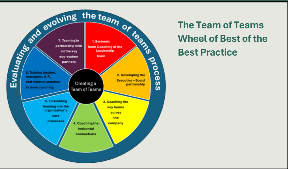
The Team of Teams Wheel of Best of the Best Practice

By combining the best practices that the research discovered around the world we developed the following ‘best of the best’ wheel of best practice.